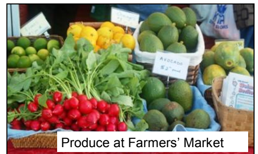
Produce at Farmers' Market

We stopped at all of the farmer's markets that we could find. In a land with potential to grow so much we really didn't see that many farmers or much produce for sale. Maybe a lot of local produce is sold directly to wholesalers or just eaten at home. We found lots of tropical fruit for sale; papayas, bananas, oranges, grapefruit, limes, lemons, tangelos, avocados, rambutan, custard apples, melons, star fruit, pineapple and more. A few vendors at each market also carried salad greens, carrots and beets or flowers, coffee, or macadamia nuts.