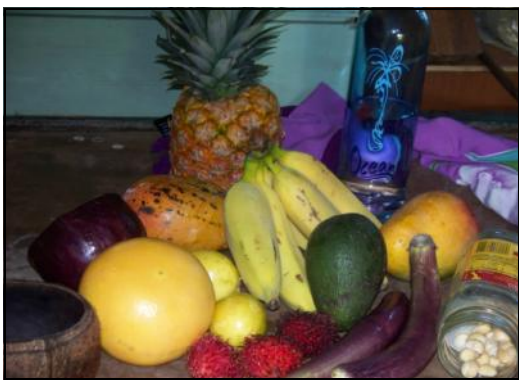
Fresh fruits and veggies each day

Permaculture makes even more sense down there. With even a little planning you can have a perennial feast growing in your back