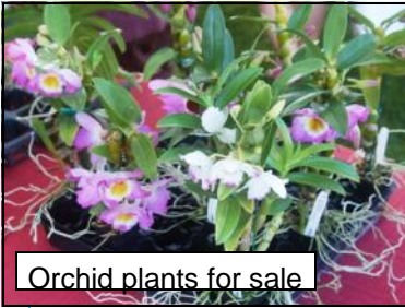
Orchid plants for sale