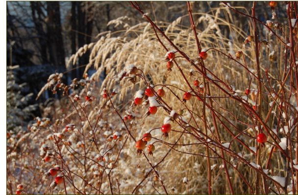
Rosa acicularis