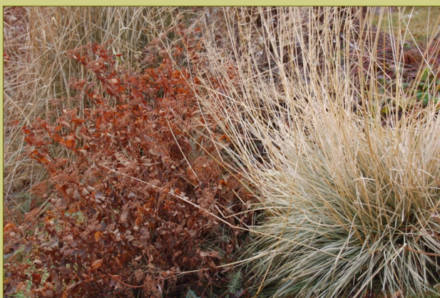
Spirea froebelii, Deschampsia, in January