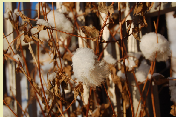
Clematis Tangutica in winter