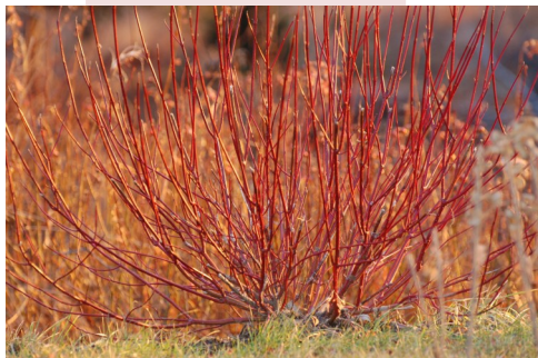
Red twig dogwood

"The establishment of Gardeners' Weekend has also been a major change for us. The popularity and scope of this event has really put our club at the vanguard of other clubs in the state."